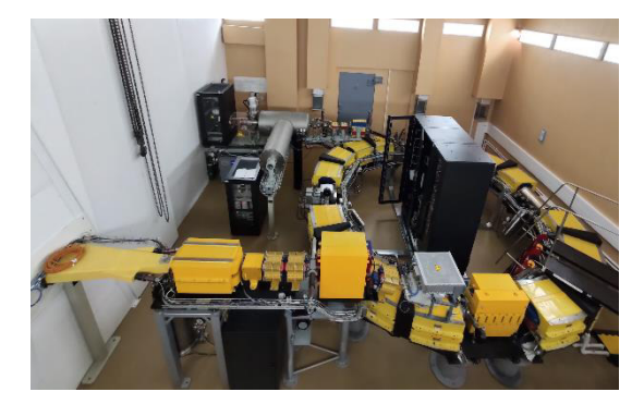
Figure 1: Protom Synchrotron-based Accelerator Complex "Prometheus" in MRRC, Obninisk, Russia.

Protom Ltd. is a manufacturer of the equipment for Proton Therapy (PT). Protom can provide full range of the technologies for PT including the accelerator complex based on the compact synchrotron, pencil beam scanning beam delivery system, patient positioning and immobilization system, treatment planning system and all needed software. The Protom synchrotron [4,5] - one of the most advanced medical accelerators in the world. It is the most compact synchrotron, the outer diameter is 5 m and the weight is 15 tons. This kind of accelerator does not use absorbers for proton range correction. That fact makes Protom synchrotron is radiation clean accelerator (radiation is produced only during patient irradiation session). Protom synchrotron is energy efficient facility. The average power consumption of all accelerator complex during treatment is 30 kW. The maximum energy of 330 MeV makes proton tomography of full patient body available [6].