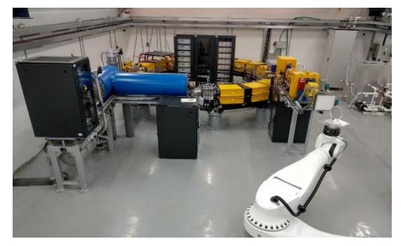
Figure 2: Protom Synchrotron-based Accelerator Complex in P-Cure, Shilat, Israel.

Basic information about these complexes is shown in the Table 1, where there first row is name of the facility, the second one consists of main manufacturers, the third one consists of permissions to treat, and the last one – locations of these facilities. Any synchrotron-based medical facility consists of beam injection system including ion source and linear or tandem accelerator, main accelerator – the synchrotron, beam extraction and transfer channels, medical part including one or several treatment rooms with patient immobilization, positioning and imagine systems.