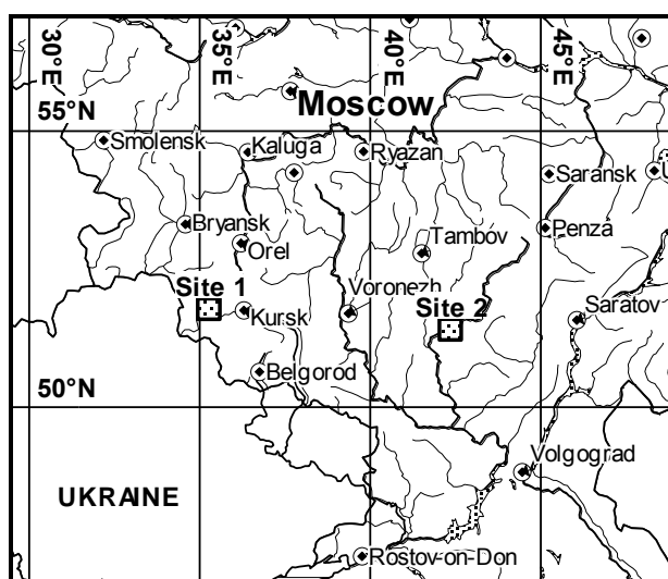
Fig.1. Location map.

The present research aims at estimating chronology of high-amplitude hydrological changes in the southern half of the East-European Plain through a study of palaeochannels preserved on river floodplains and low terraces. The research schedule includes (1) identification of palaeochannels on topographic maps (1:25000 - 1:100000) and aerial photos, measuring palaeochannel parameters (width, meander wavelength and curvative) and grouping them into separate age generations; (2) studying palaeichannel geological composition and establishing their depth and active section area by making boreholes and examination of natural exposures; (3) establishing absolute age of palaeochannels through radiocarbon dating of organic matter from different alluvial facies (active channel alluvium, base of palaeochannel infill); (4) estimation of river discharge changes in the past from the transformation of palaeochannel parameters with time. Detailed investigations were completed at two key sites located within the present-day belt of forested steppes characterised by moderate continental climate (Fig.1). The